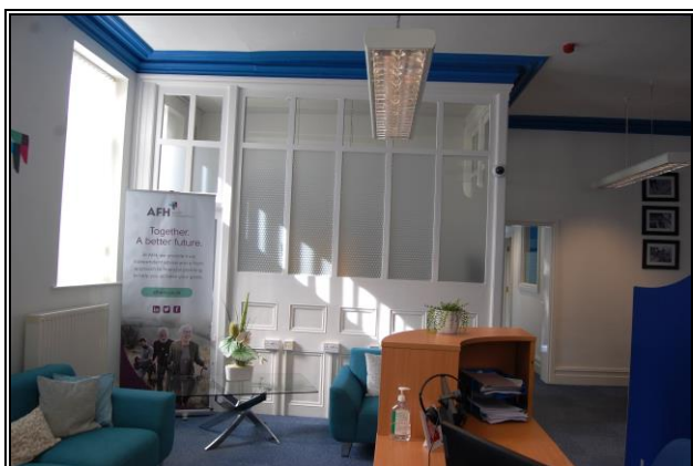
Private Reception Office