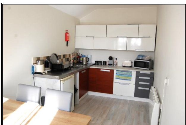
First Floor Kitchen